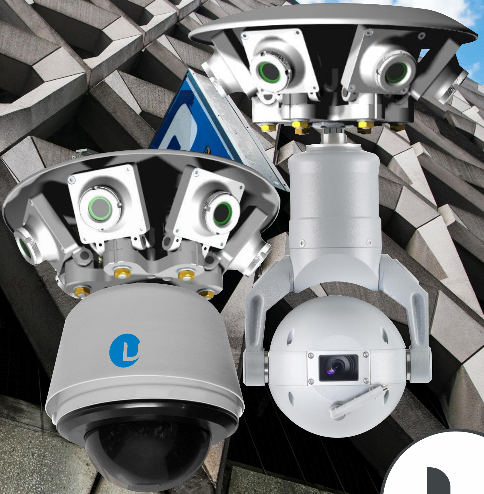
SEMI COVERT MODEL

iVOS™ Intelligent Virtual Operator Software