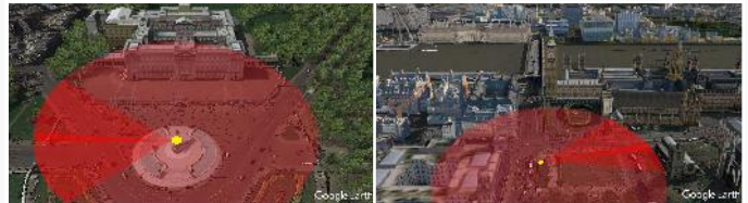
100 x MORE PEOPLE/VEHICLES SCANNED - UP TO 2000 AT ANY 1 TIME